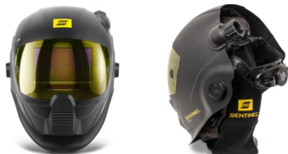
Compact shell with optional amber-coloured protective outer lens.