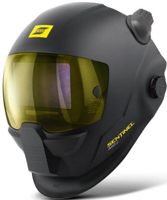
Sentinel A60 Air