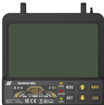
Advanced CE 1/1/1/1 ADF technology with a simple interface and clear graphic display.